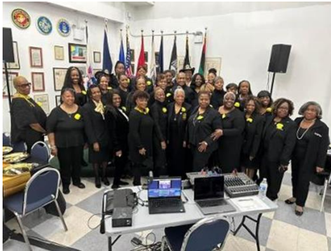
Members from Bklyn, NYC, ATL, Texas, DMV, LA, NJ, South Carolina, Florida, MD