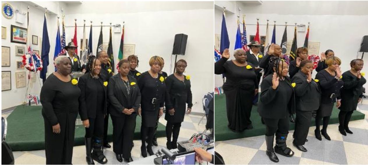
Brooklyn Chapter Installation, NABMW