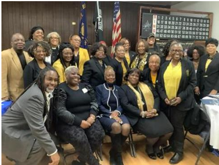
NABMW NYC Meet & Greet Group Photo