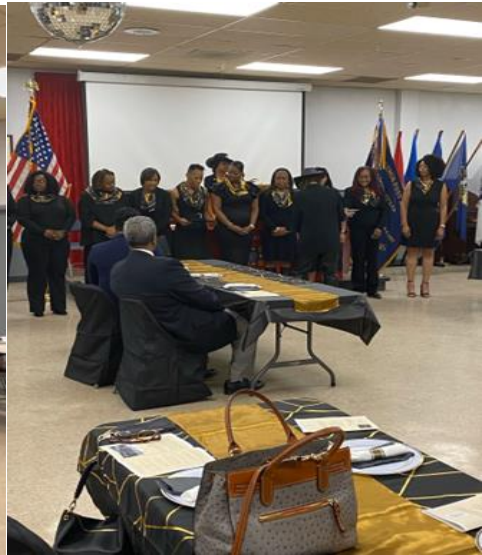
Meet the Houston Chapter