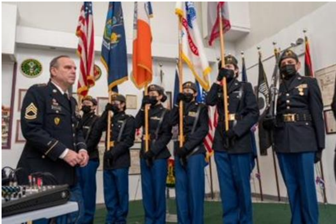
Fort Hamilton High School JROTC, Brooklyn, New York