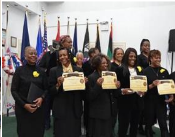
Installation of the National Officers of NABMW