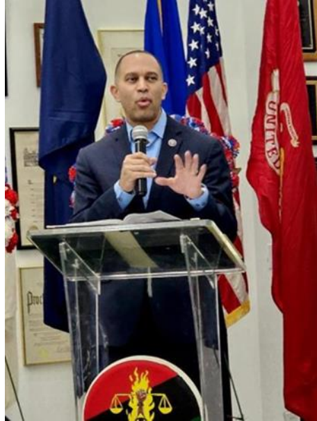
The Honorable Hakeem Jeffries