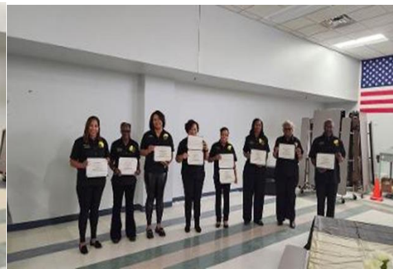
Meet the Chicago Chapter